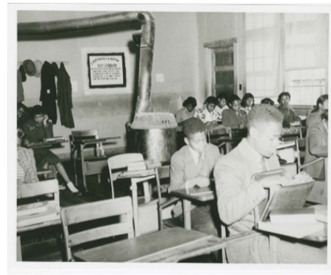
Brown v. Board of Education - History.com