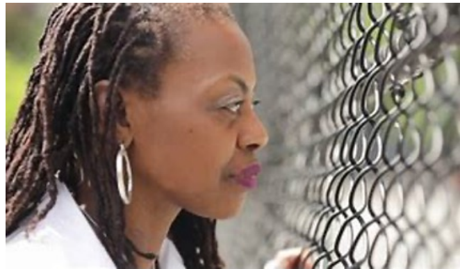
An Archaeology of Self for Our Times