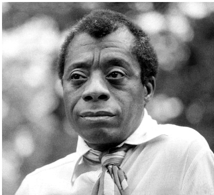
A Talk To Teachers